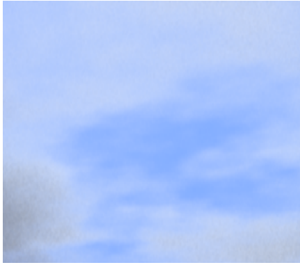
Fig. 4. These clouds are not a texture.