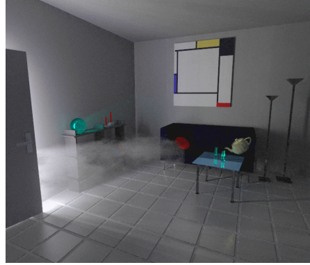
Fig. 5. The scene Invisible Date with smoke, lit through the door slit.