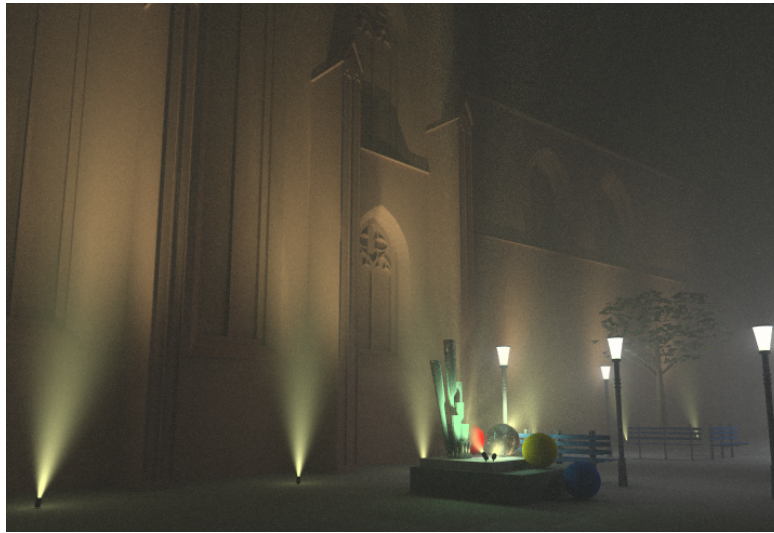
Fig. 6. The Stiftsplatz in a foggy atmosphere.