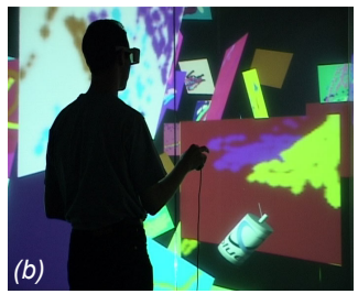
Figure 2: (a) Distributed chess. (b) Collaborative painter.