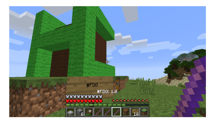
Figure 2: Diviningrod displaying the distance to a sign.